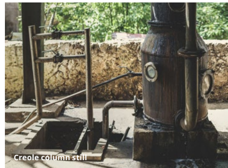
Creole column still