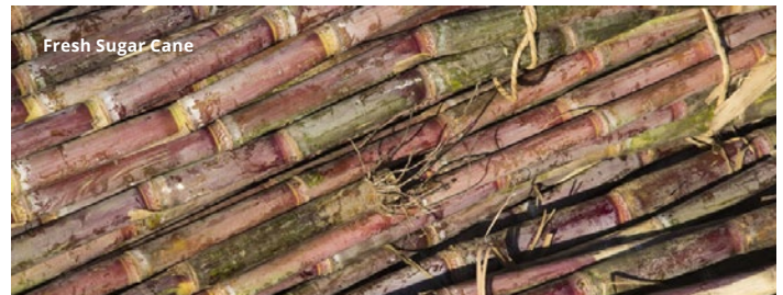
Fresh Sugar Cane