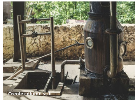
Creole column still