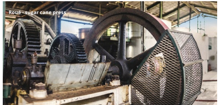
Roule - sugar cane press